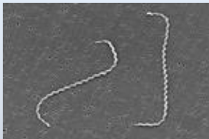
Figure 1: Leptospira bacteria under the microscope.

Recently we saw a case of suspected Leptospirosis in a pig hunting dog. Leptospirosis is a very severe disease, transmissible to people, and since the Leptospira bacteria are shed in infected dogs' urine in high numbers, these dogs pose a significant health risk to their owners. Hunting dogs are at increased risk of contracting Leptospirosis because feral pigs commonly carry the infection and dogs become infected by close contact with the pigs or by eating infected tissue. Also, dogs on farms (especially Dairies – Leptospira thrive in wet conditions) are at increased risk. We recommend Leptospirosis vaccination for any pig hunting or dairy farm dogs to protect them from infection and by extension, protect their owners. We would also strongly recommend 7 in 1 vaccination of Dairy cattle to minimise the risk of exposure to farmers. Symptoms of Leptospirosis in dogs include: high fever, vomiting, inappetence, blood in the urine, lethargy, jaundice and depression. With treatment, survival rate can be up to 80%, without treatment, death usually results.