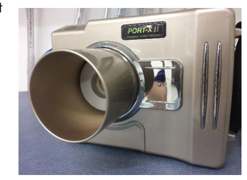
Figure 2: Our new dental x-ray generator

the gum line and in the jaw bone. High quality dental x-ray is crucial to maintaining high standards of dentistry. Without these standards, many dogs and cats are left with either painful teeth that should have been removed or have had healthy teeth removed unnecessarily. We recently purchased a top quality portable dental x-ray unit, when it became apparent our old wall-mounted dental x-ray was becoming tired. We have been getting some great images and it has also proved extremely handy during orthopaedic surgeries, for checking screw and pin positioning during the procedure.